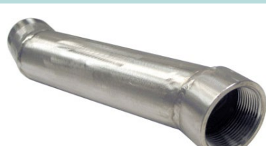
Offset Discharge Pipe ,SS, with 1-1/2" FNPT inlet, and 1-1/2" MNPT

This Offset Discharge Pipe was designed to be used with a 3/4 HP Vertical SurePump. The offset allowed for optimum alignment with the discharge pipe at the sump.