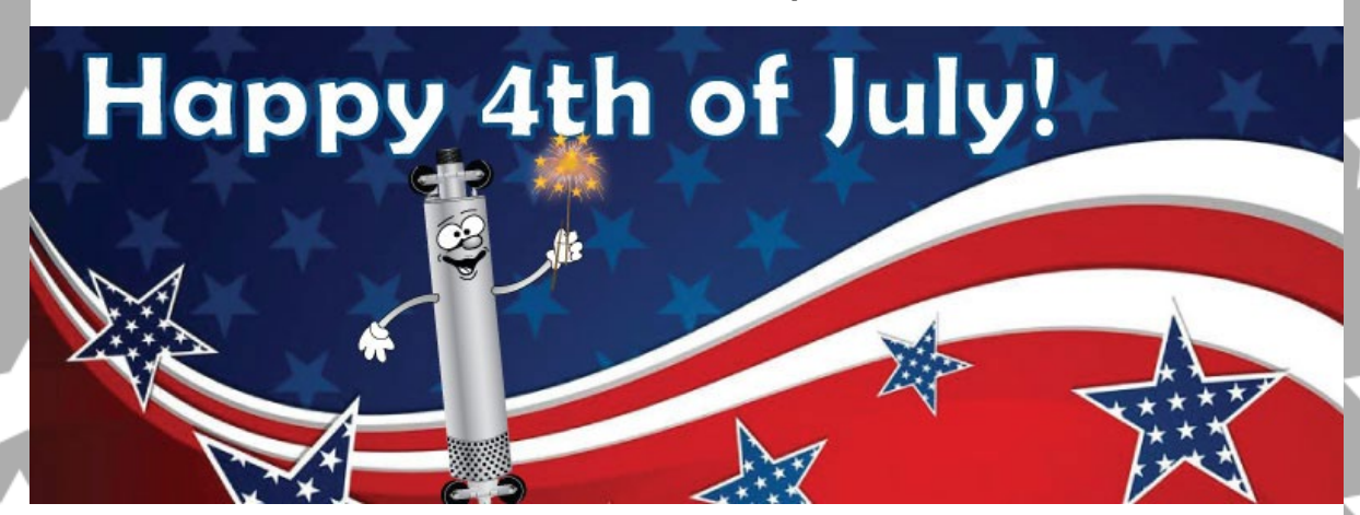
In observance of Independence Day, our office will be closed July 4th.

In This Issue: For the Municipal Water Crowd