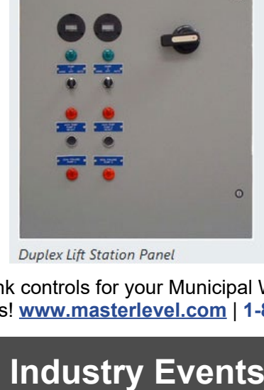
Duplex Lift Station Panel