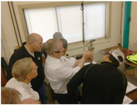
2017 Service School - Pumps & Controls