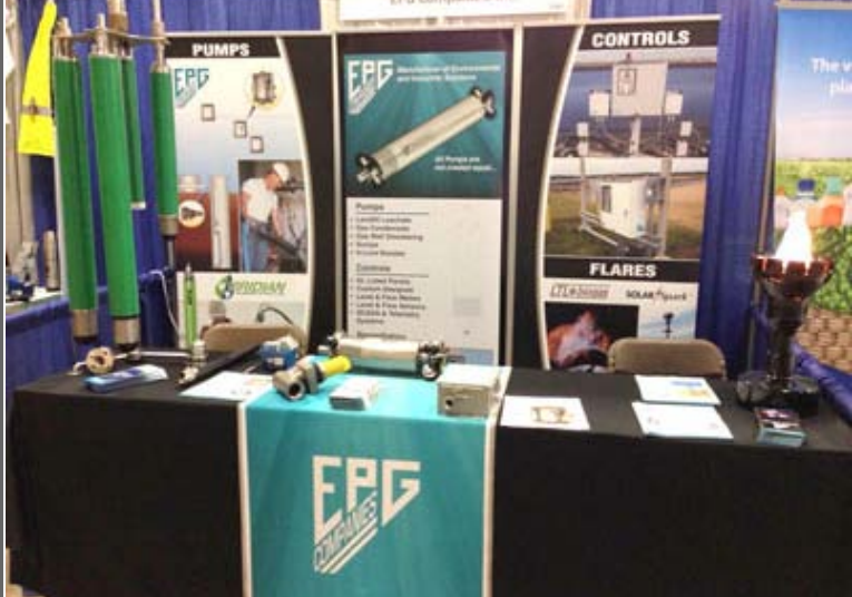
The EPG booth at the NY Federation Spring Conference and Trade Show in Bolton Landing, NY

We look forward to meeting people at upcoming shows including the Global Waste Management Symposium in Orlando and WASTECON in Dallas.