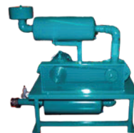
Air Sparge Equipment