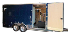
Trailer Mounted Systems