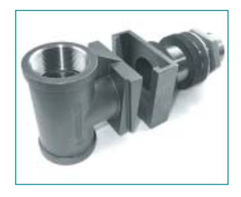
New & Improved 2" Disconnect

For more information, visit our web site or call EPG today.