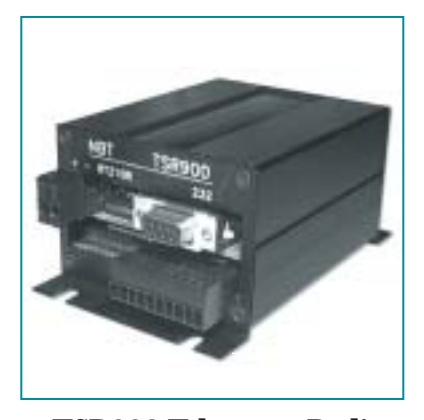
TSR900 Telemetry Radio

EPG's 4-Wire Interface Sensor, with optional mounting bracket, is a small diameter, vertically suspended, product-water-air sensor that incorporates a normally closed (N.C.) level displacement sensor (float) with normally open (N.O.) conductivity probes. The level displacement sensor floats in both water and product and can be used as either an indicator or a product pump sensor. This combination of both a level displacement sensor and conductivity probes allows the interface sensor to detect when it is positioned in product, water or air. The 2-Wire Interface Sensor is also available to detect positioning in product.