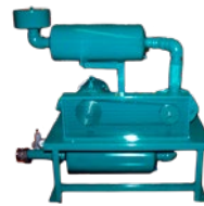
Air Sparge Equipment