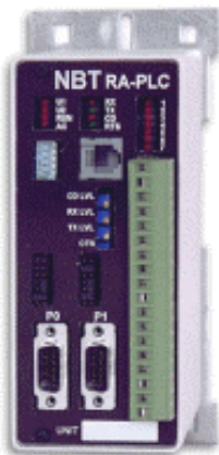
SM800 Series MP PLC Communications Controller

Managers/operators can be informed 24 hours a day through automatic email. .