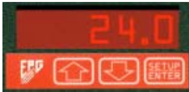
EPG 2551 microprocessor-based level meter

MPs, like MTUs, can continuously collect, process and store data . . .