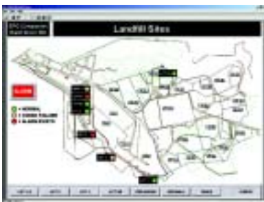
The HMI allows the operator to view virtually all system alerts, warnings and functions. . .

Public media transmission includes services offered by your local telephone or cable company and in some systems and/or subsystems may provide a more suitable method for data transfer. The Public Switch Telephone Network (PSTN), Generally Switched Telephone network (GSTN) and the Cellular network are dial-up services suitable for occasional use. If you need a 24-hour permanent connection for analog (continuously varying signal) data transmission between two or more locations, the Private Leased Line (PLL) should be considered. The Digital Data Service (DDS) with the Digital Subscriber Lines (DSL) and Integrated Service Digital Network (ISDN) should be considered for high speed/low error rate, computer-to-computer applications. WiFi equipment utilizes broadband as well, but on a "time-share" basis when it makes sense to use the infrastructure of another company. PCS/CDPD service, provided by cellular companies, and Low Earth Orbit (LEO) or Geosynchronous satellites can also be used for continuous communication.