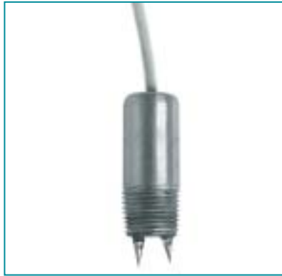
Leak Detection Sensor

EPG's Leak Detection Sensors utilize stainless steel electrodes to detect the presence of conductive fluids. They are mounted in a small diameter stainless steel housing that adds weight, allowing the sensor to be suspended in a small annular space. Each sensor has 35' (standard) of yellow waterproof, gasoline, oil and chemical resistant outer jacket over a twisted pair of color coded signal wire. The sensor is set at the point where leakage is to be detected. Conductance is made from probe to probe through the liquid.