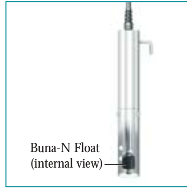
Truck Full Float

EPG's Leak Detection Sensors utilize stainless steel electrodes to detect the presence of conductive fluids. They are mounted in a small diameter stainless steel housing that adds weight, allowing the sensor to be suspended in a small annular space. Each sensor has 35' (standard) of yellow waterproof, gasoline, oil and chemical resistant outer jacket over a twisted pair of color coded signal wire. The sensor is set at the point where leakage is to be detected. Conductance is made from probe to probe through the liquid.